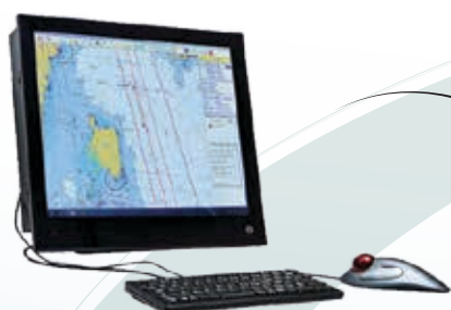
Real Type approved ECDIS