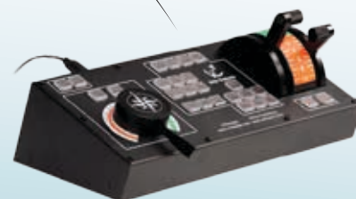
desktop basic console