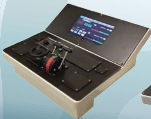
desktop console real controls ManSim Touch