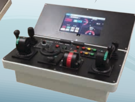
desktop console real controls ManSim Touch ADVanced